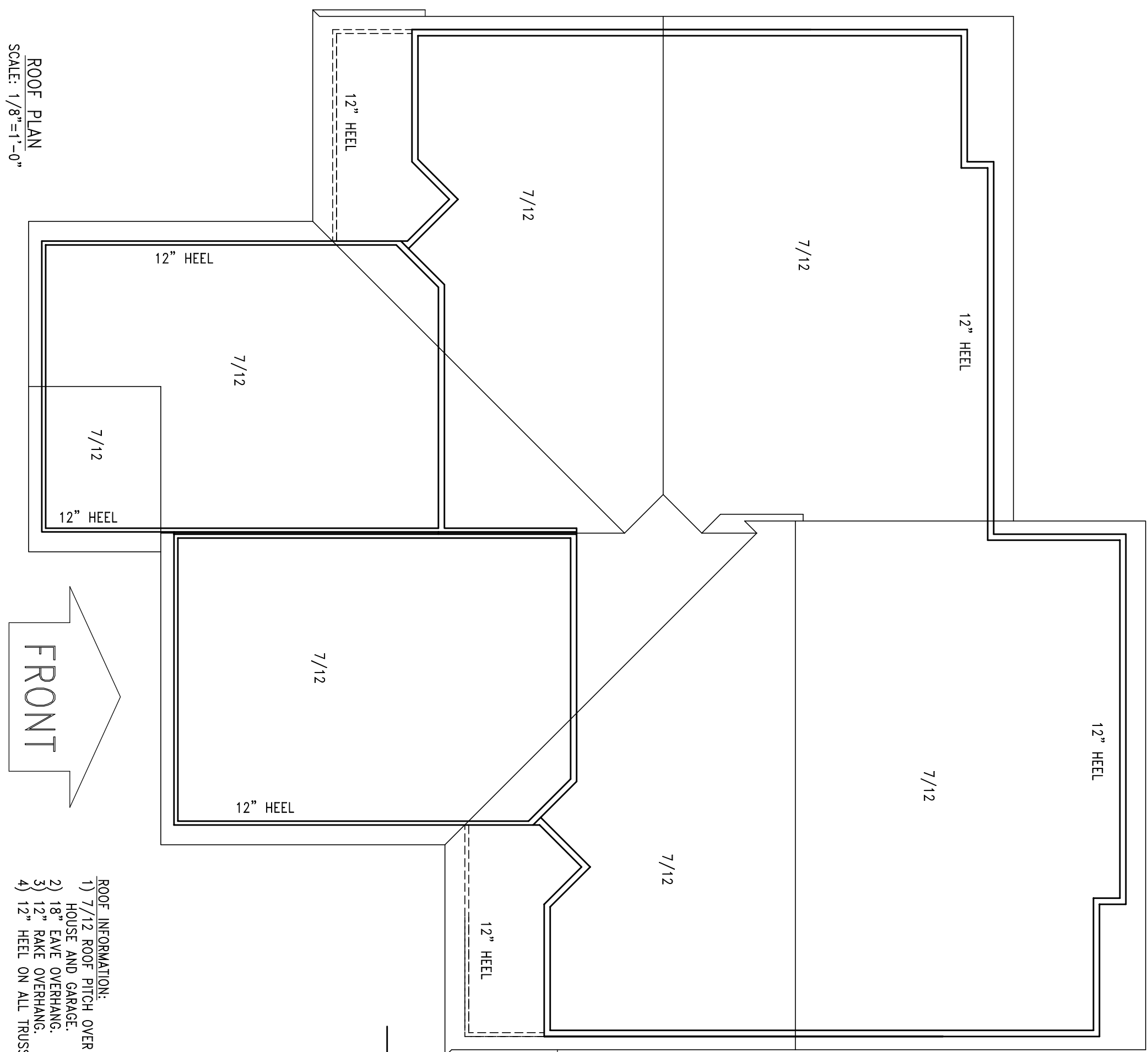
ROOF PLAN SCALE: 1/8"=1'-0"